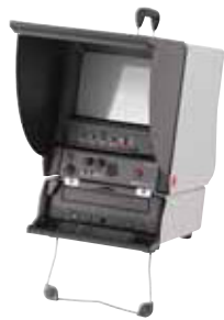
Monitor + VCR