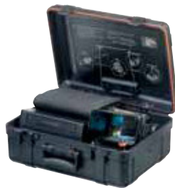
Color Tool Case